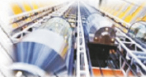
Elevators and Escalators