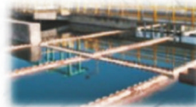
Water and Wastewater