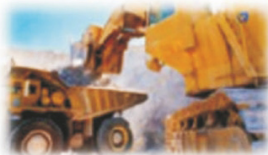
Mining and Metals