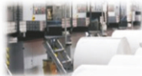
Pulp and Paper